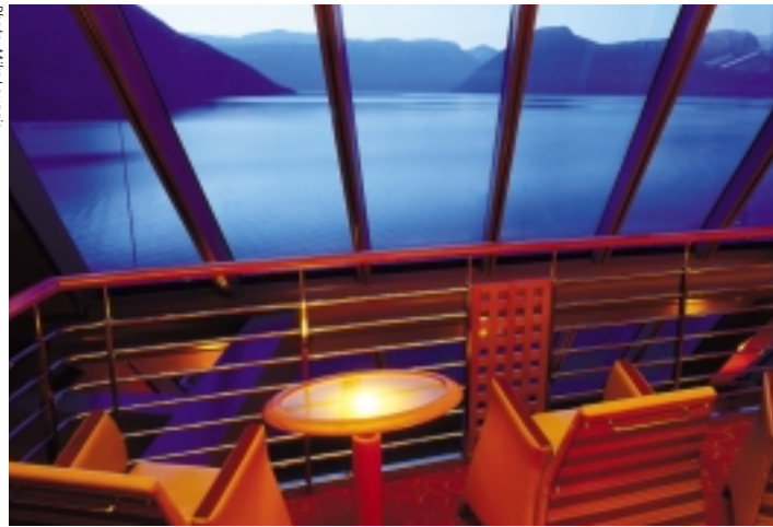
SGG PYROSWISS MARINE, A MULTI-PURPOSE SINGLE PANE.