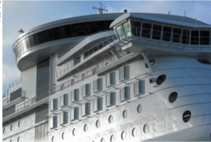
SGG CONTRAFLAM MARINE, FOR MANY APPLICATION POSSIBILITIES.