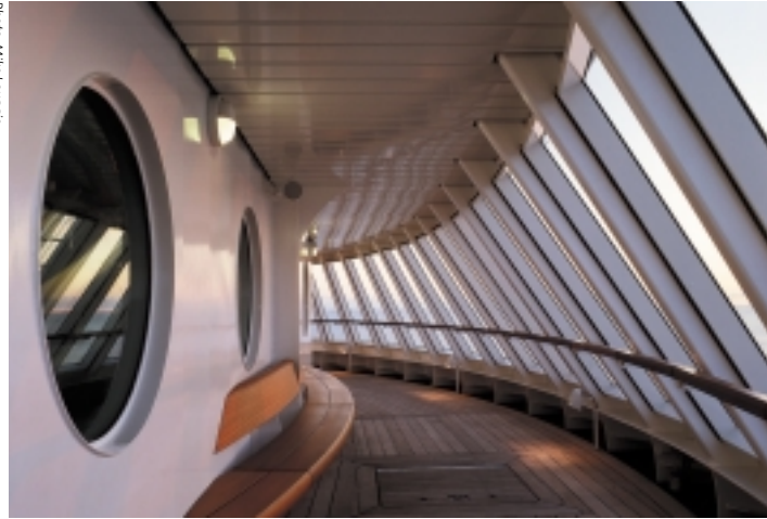
PORTHOLES WITH SGG CONTRAFLAM LITE MARINE.